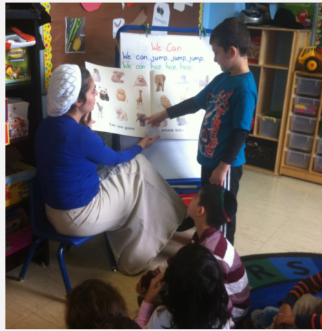
K2 participate in a read aloud question and answer.