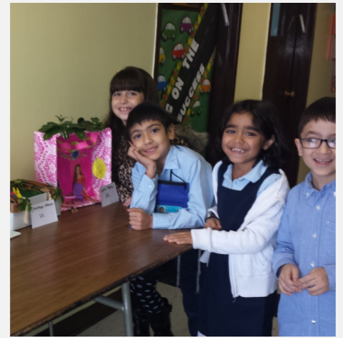
JIQ students prepare beautiful model Sukkot.