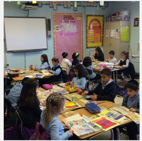
1D Enjoys reading.