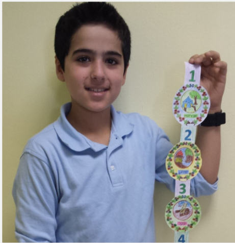
4B made beautiful Ushpizin projects for Sukkot.

EMAIL JIQNEWSLETTER@GMAIL.COM FOR DETAILS