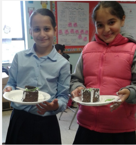
5G enjoyed making their very own edible Sukkot.