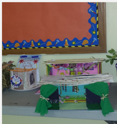
More of our Sukka Contest Entries.