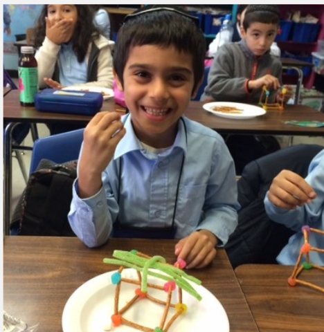
3P Made delicious edible Sukkot.