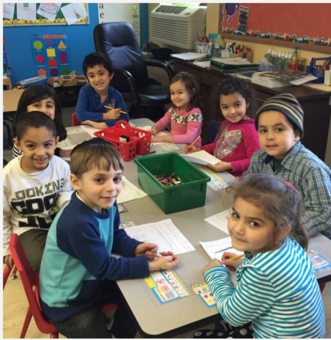
K1 Writes about the fun they had over Sukkot.