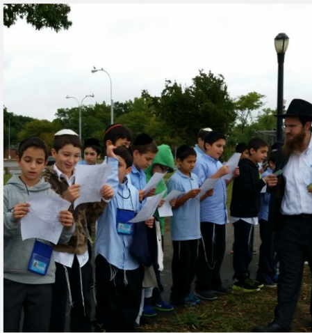
6B go on a special field trip to do the Tashlich prayer.