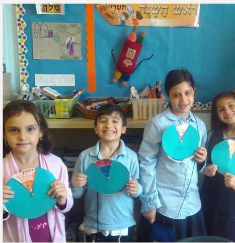
2G made a special Ushpizin project for Sukkot.