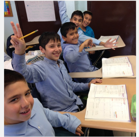
5B explore how to classify living organisms in science.