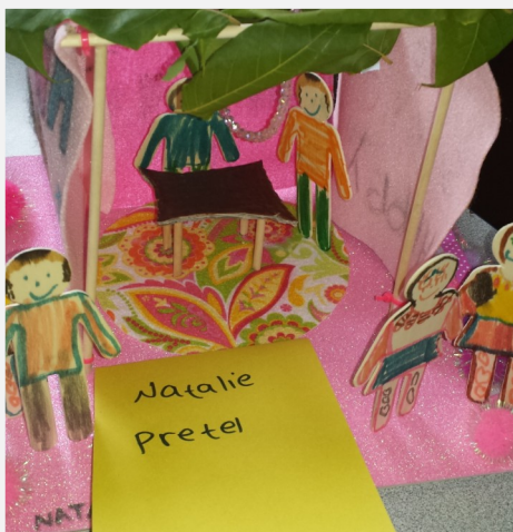
One of our Sukka Contest entries.