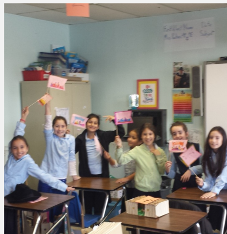
4P created their very own flags for Simchat Torah.