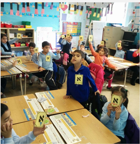
1K learns Kamatz Alef.