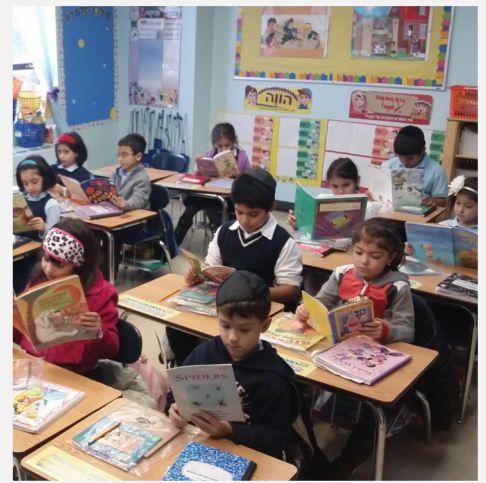
2R is working on building their independent reading stamina.