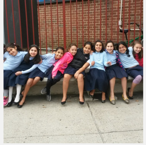
4E heading to their Tashlich Trip.