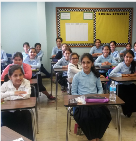
6G learns about the harmful effects of bullying.